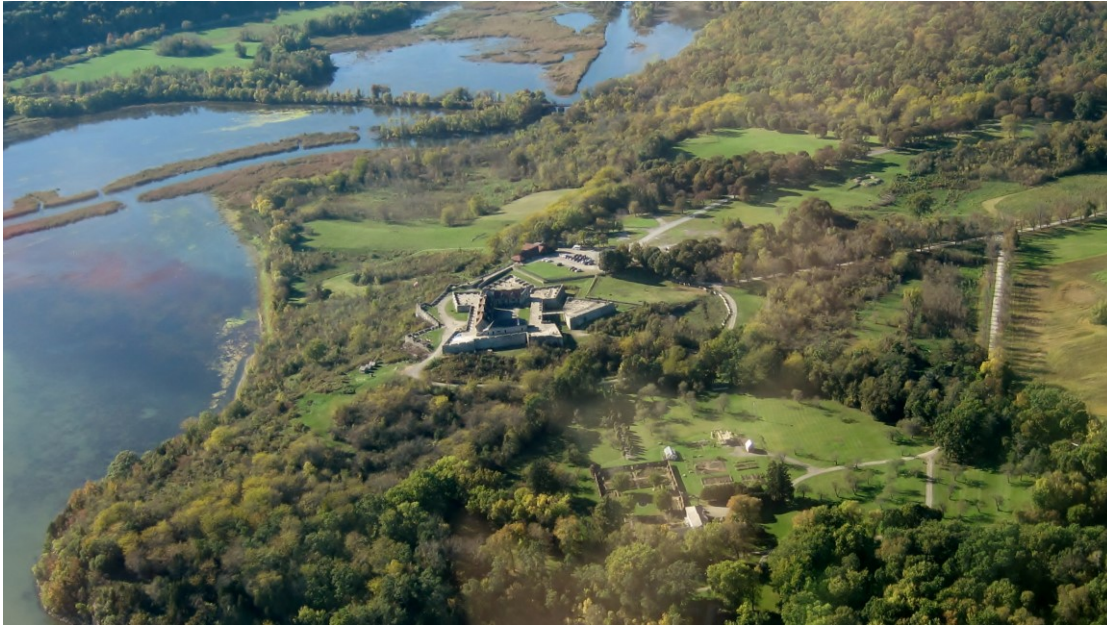
Aerial photo of Fort Ticonderoga, New York.